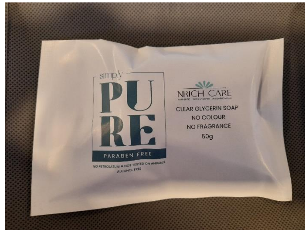
Photo of the Submitted Sample

Bureau Veritas Consumer Products Services Lanka (Pvt) Ltd.