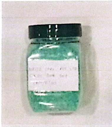
Photo of the Submitted Sample